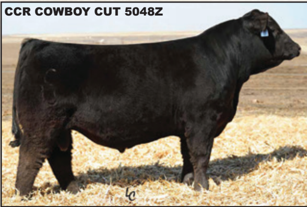
CCR COWBOY CUT 5048Z