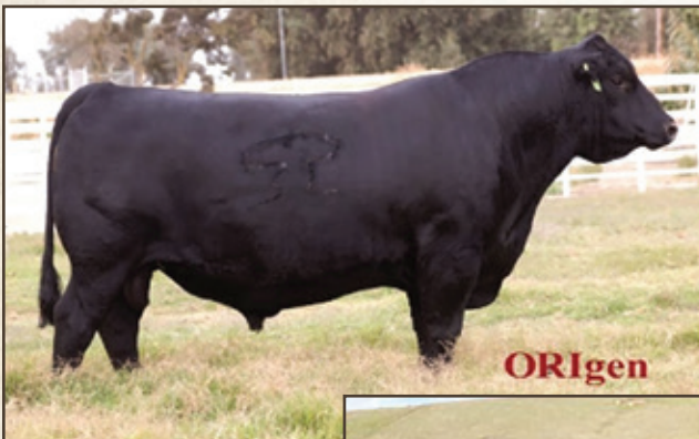
BASIN RAINMAKER 4404

Heifer pairs are bred to sons of Basin Rainmaker 4404, SAV Seedstock and GAR Ashland