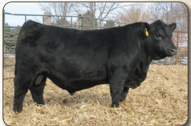
Brookdale Presidential 1059 - Sire & Grand sire to Lots 23-28

Isaiah 40:31 "But those who wait on the Lord shall renew their strength."