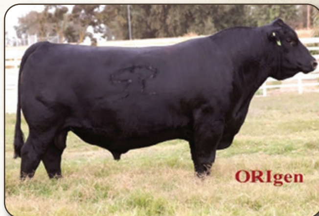
Basin Rainmaker 4404 – Sire of Lot 35

A long made good calving ease bull. He is clean made and sound to cover heifers then cows extremely well. He will sire outstanding replacement females.