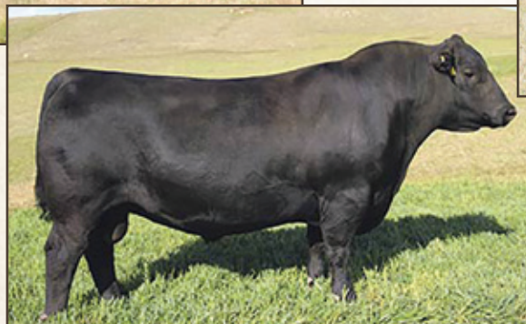
SAV SEEDSTOCK 4838