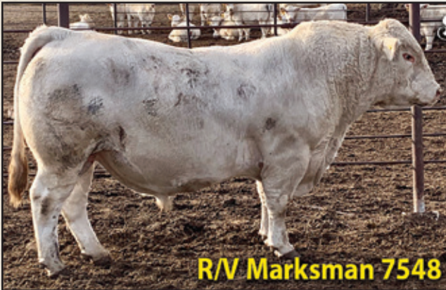
R/V Marksman 7548