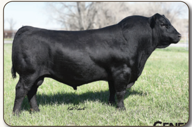
HA Prime Cut 4493 - Maternal Grand sire to Lot 17

+11 CED with a 141 YW EPD and from the Blackbird cow family. This is a calving ease bull you can count on to have an immediate positive impact to your bottom line and an even larger long term impact through the superior production capabilities of his daughters.