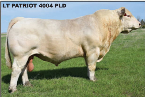
LT PATRIOT 4004 PLD