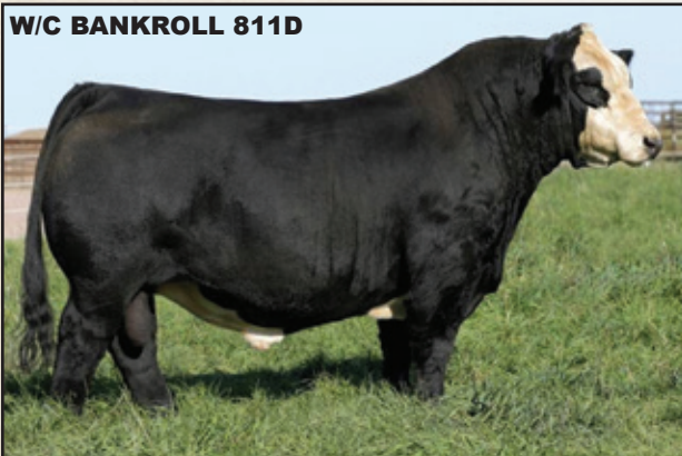
W/C BANKROLL 811D